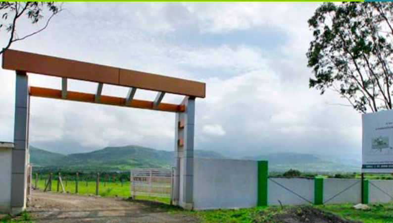
MOUNT VIEW 34 LOCATION: PACHANE