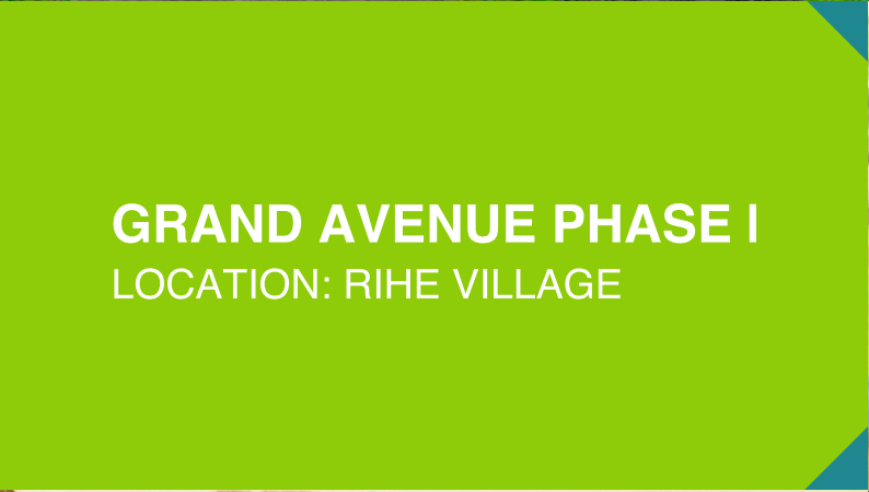
GRAND AVENUE PHASE I LOCATION: RIHE VILLAGE