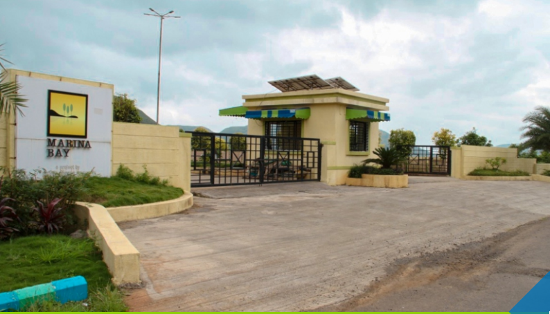
MARINA BAY LOCATION: KHAMBOLI