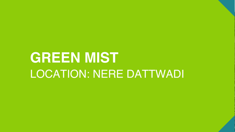
GREEN MIST LOCATION: NERE DATTWADI