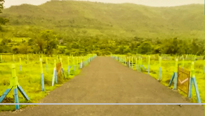
GRAND AVENUE PHASE II LOCATION: RIHE VILLAGE